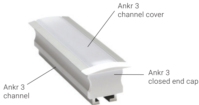
Ankr 3 shown with closed end cap